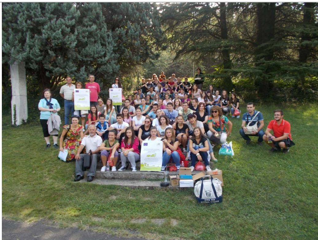
Joint field work in Bulgaria