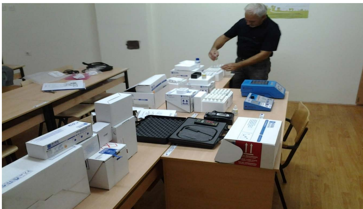
Instruments and other equipment in High school Goce Delchev Valandovo ( PP3)