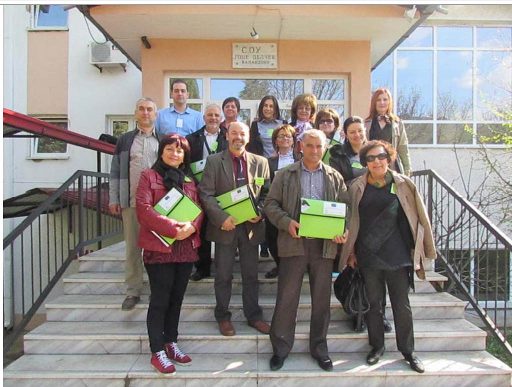
Education of teachers –TOT 1 Seminar in Valandovo,Macedonia