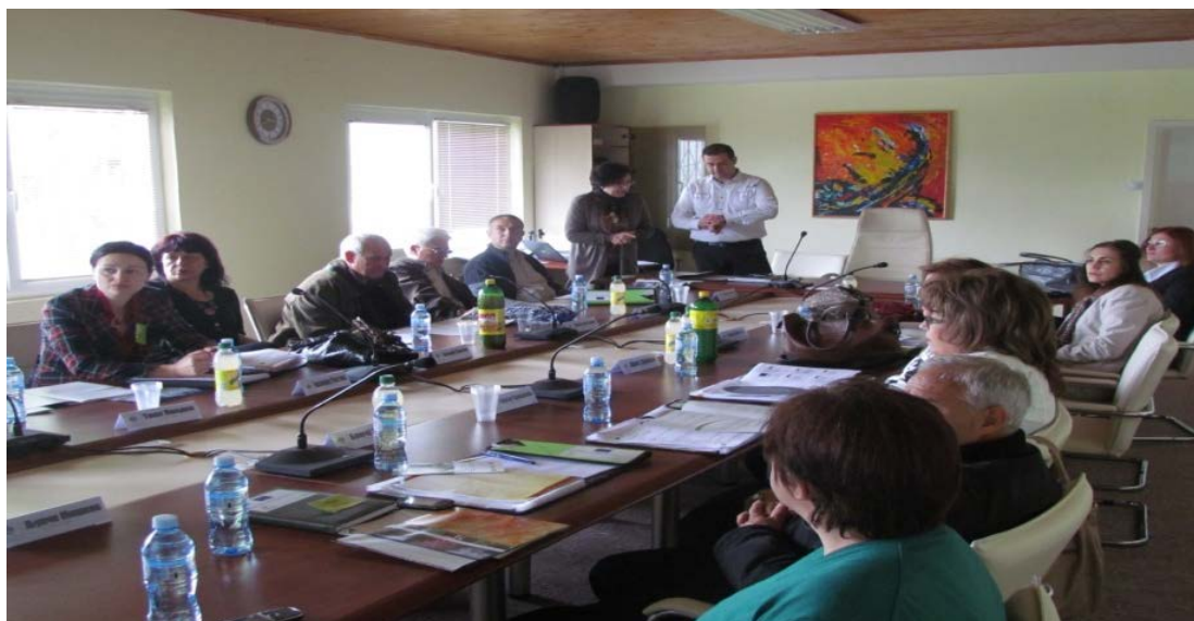
Education of teachers –TOT 3 seminar in Valandovo ,Macedonia