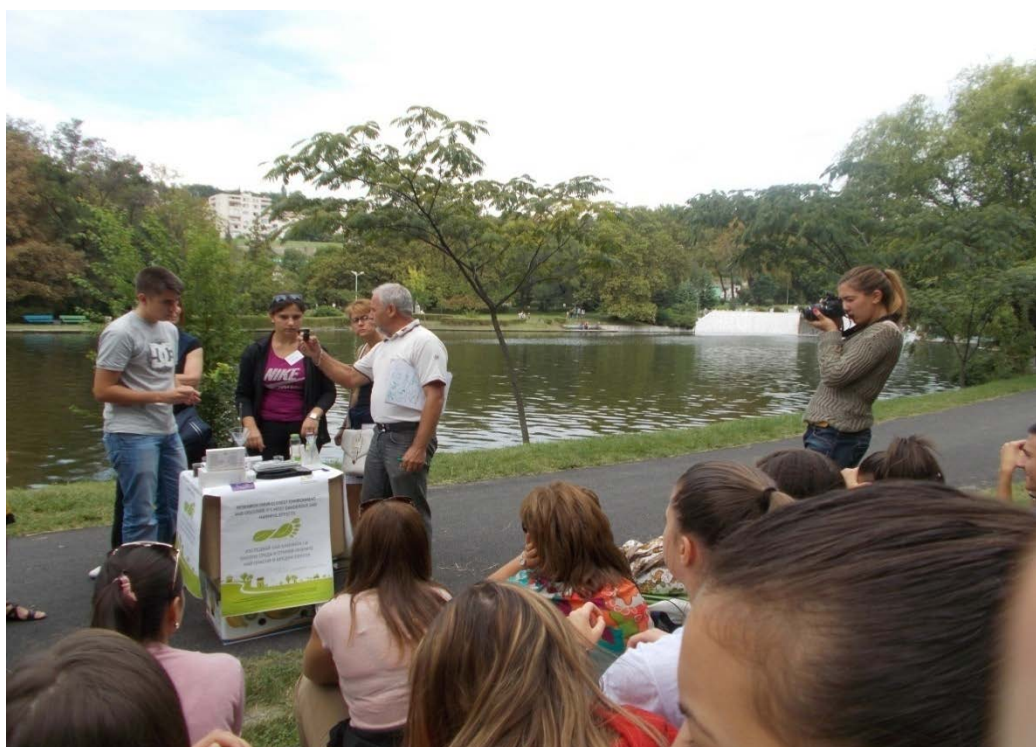
Joint field work in Bulgaria