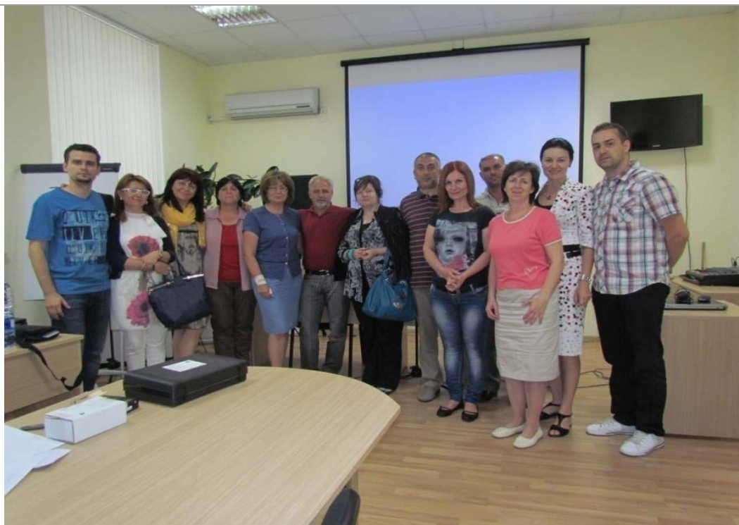
Education of teachers –TOT 4 Seminar in Sandanski,Bulgaria