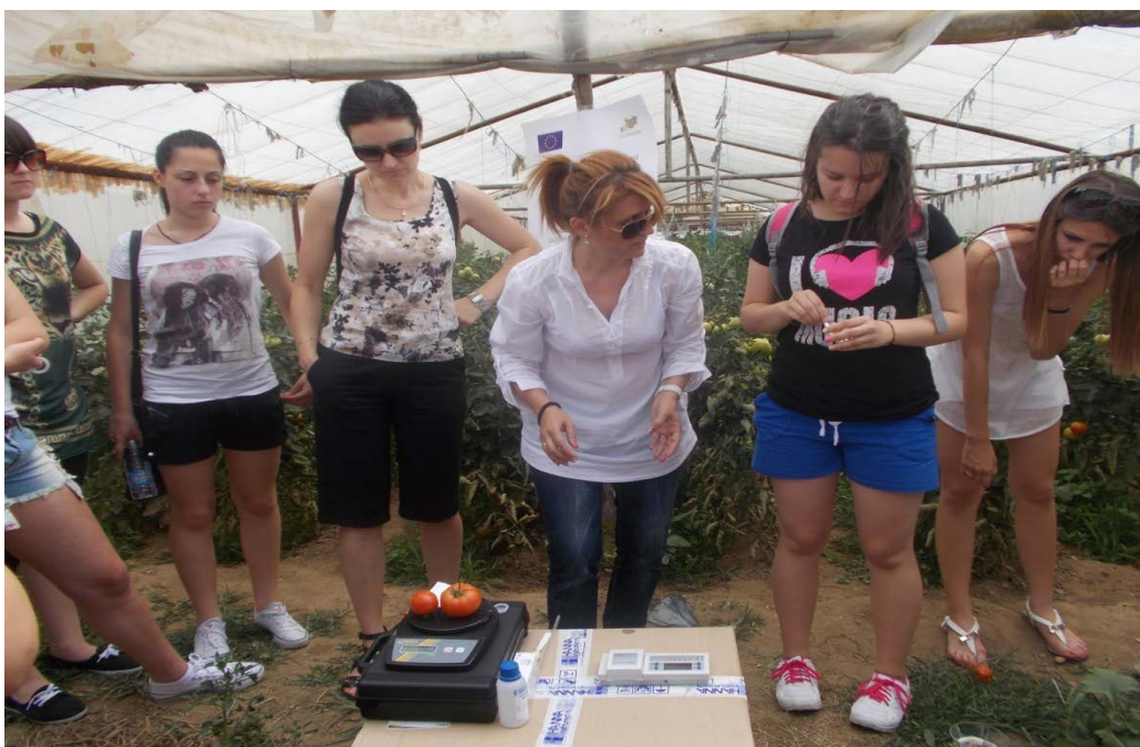
Implementation of fieldwork and advocacy activities with students from high school Kliment Timiryazev from Sandanski ,Bulgaria