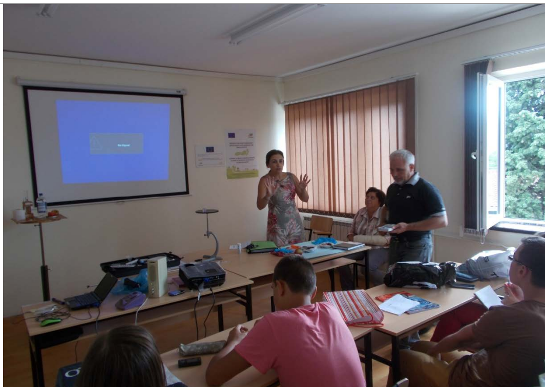
Education of students in Valandovo, Macedonia