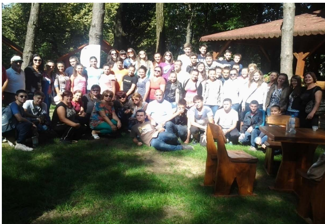
Joint field work in Macedonia