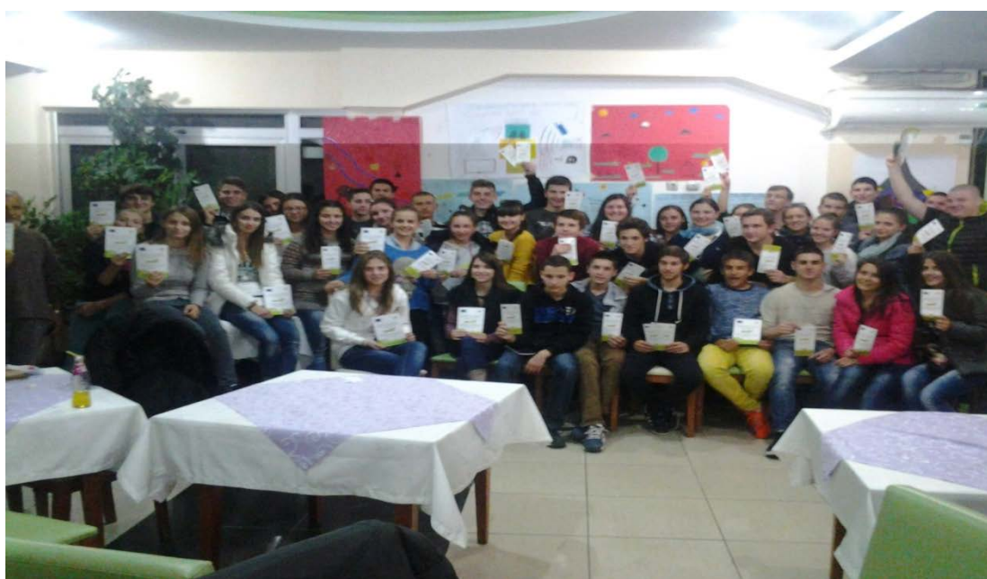
Knowledge Transfer workshop in Dojran, Macedonia