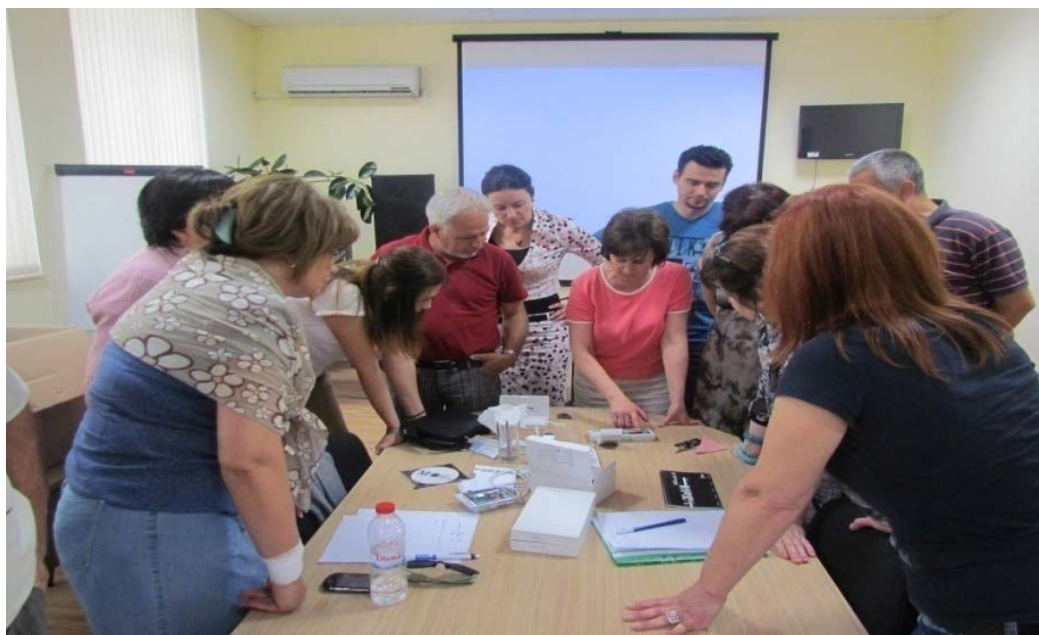
Education of teachers –TOT 4 Seminar in Sandanski,Bulgaria