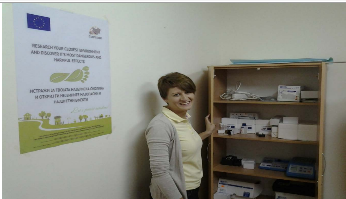
Instruments and other equipment in High school Goce Delchev Valandovo ( PP3)