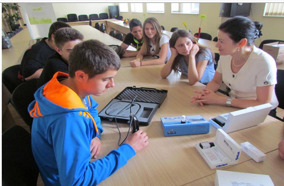
Education of students in Sandanski, Bulgaria