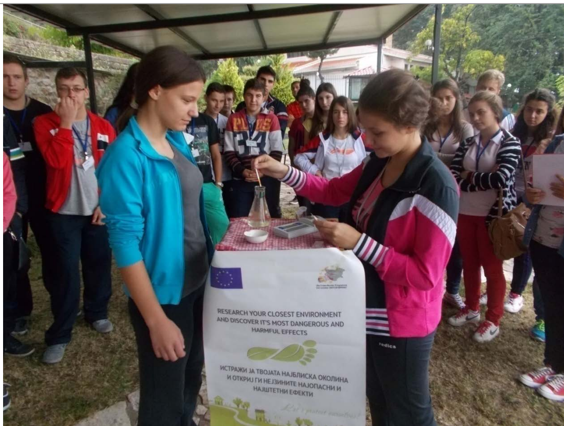
Implementation of fieldwork and advocacy activities with students from high school Goce Delchev Valandovo