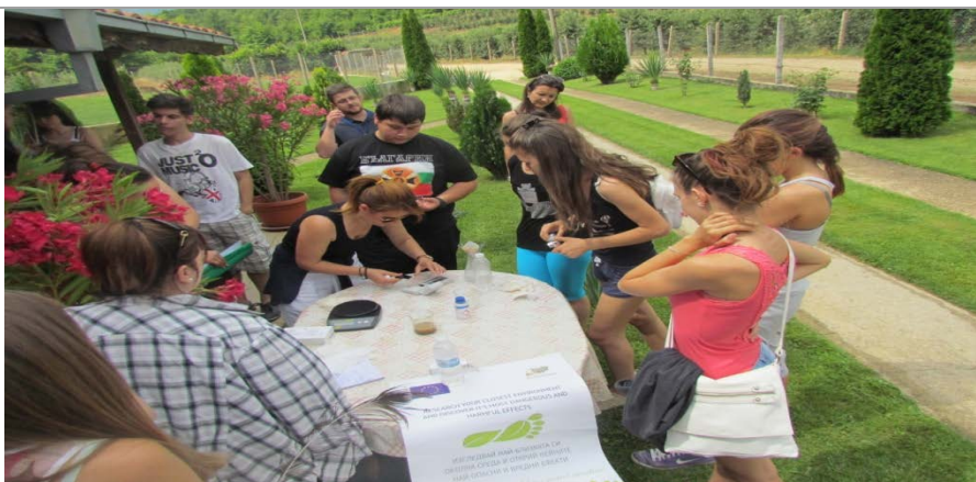
Implementation of fieldwork and advocacy activities with students from high school Kliment Timiryazev from Sandanski ,Bulgaria