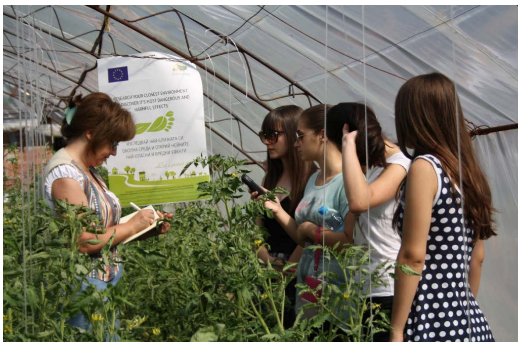
Implementation of fieldwork and advocacy activities with students from high school Kliment Timiryazev from Sandanski ,Bulgaria