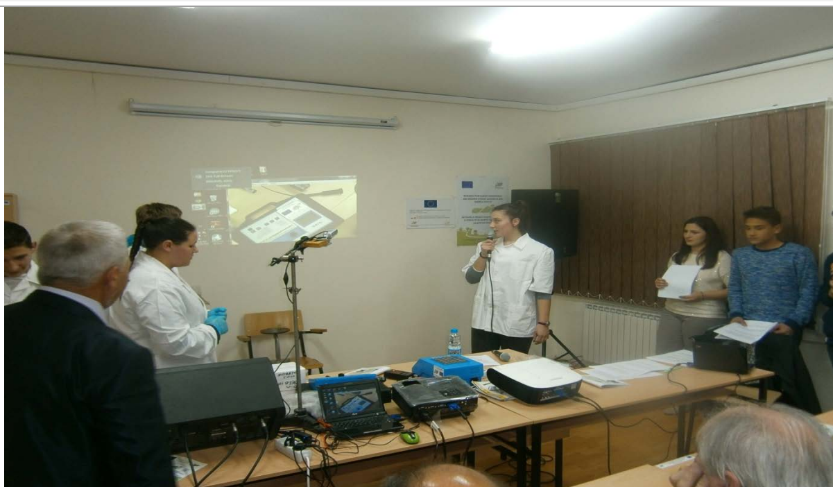
Final presentation in Valandovo, Macedonia ( PP3)