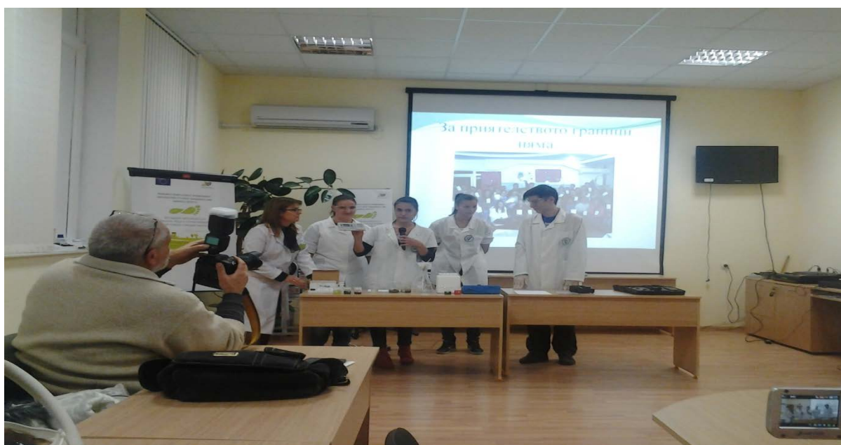
Final presentation in Sandanski ,Bulgaria ( PP2)