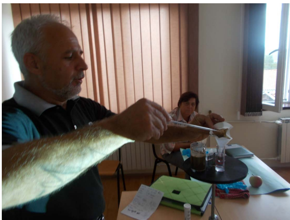
Education of students in Valandovo, Macedonia