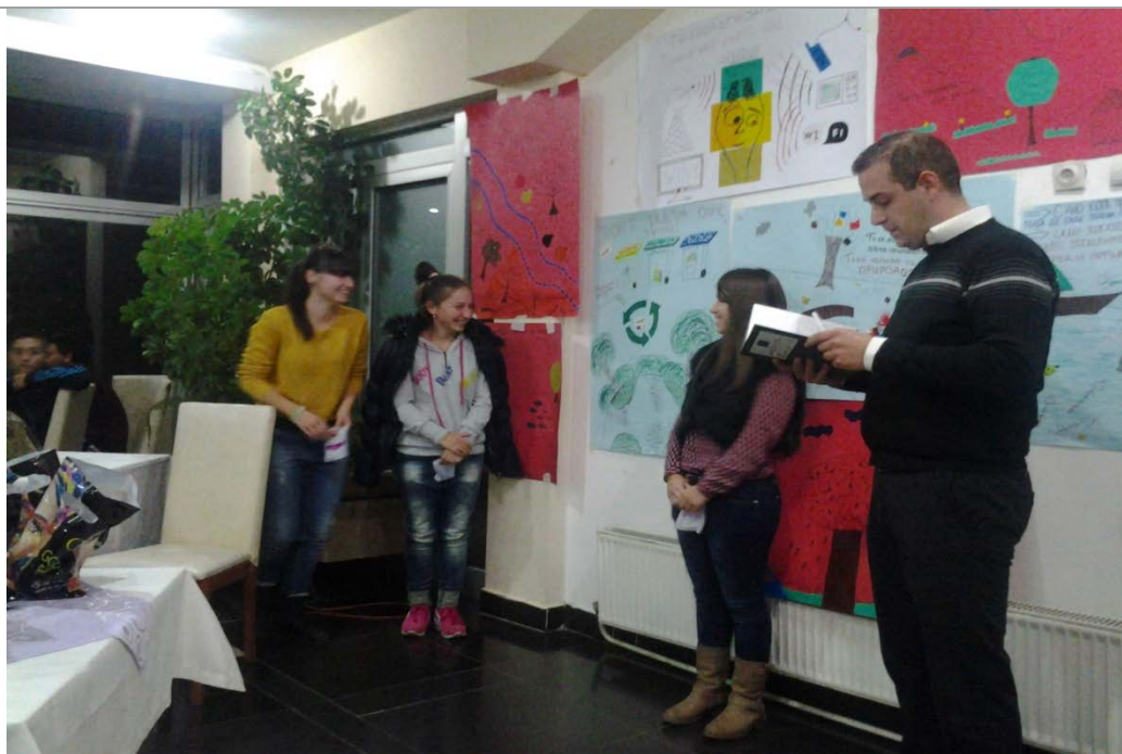
Knowledge Transfer workshop in Dojran, Macedonia