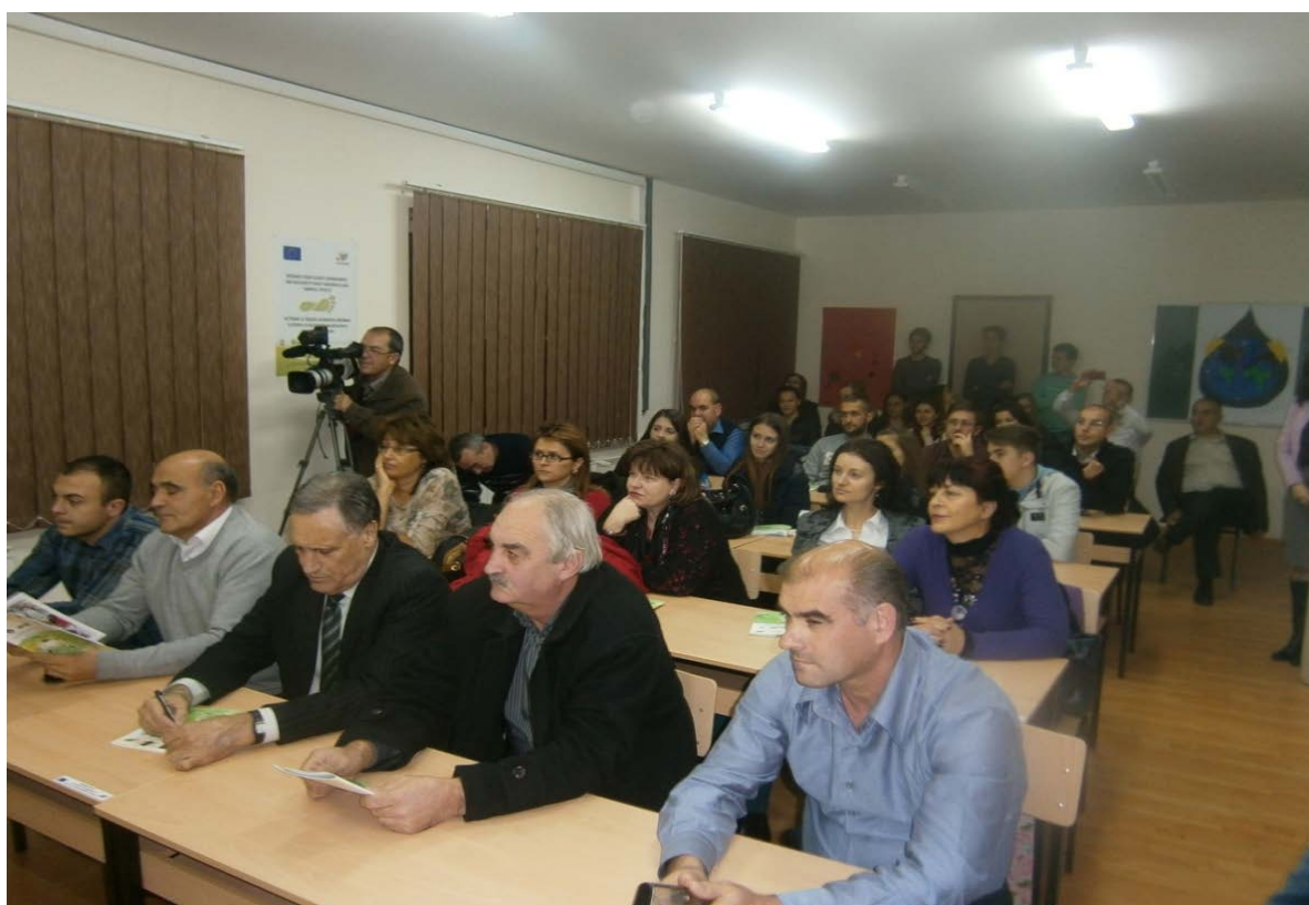
Final presentation in Valandovo, Macedonia ( PP3)