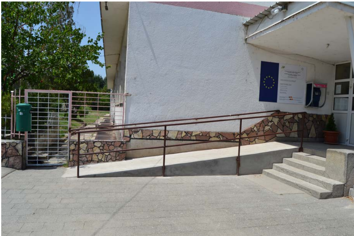
“Toli Zordumis” - Kumanovo