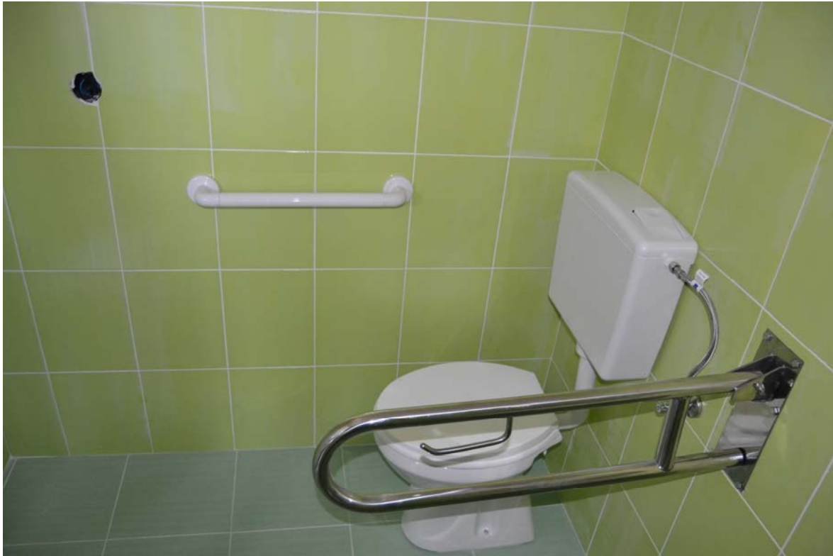
“Doturija” - Kumanovo