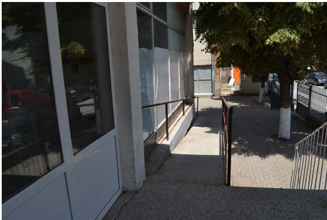
“Bajram Shabani” - Kumanovo