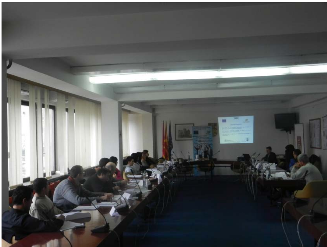
Motivation training Kumanovo