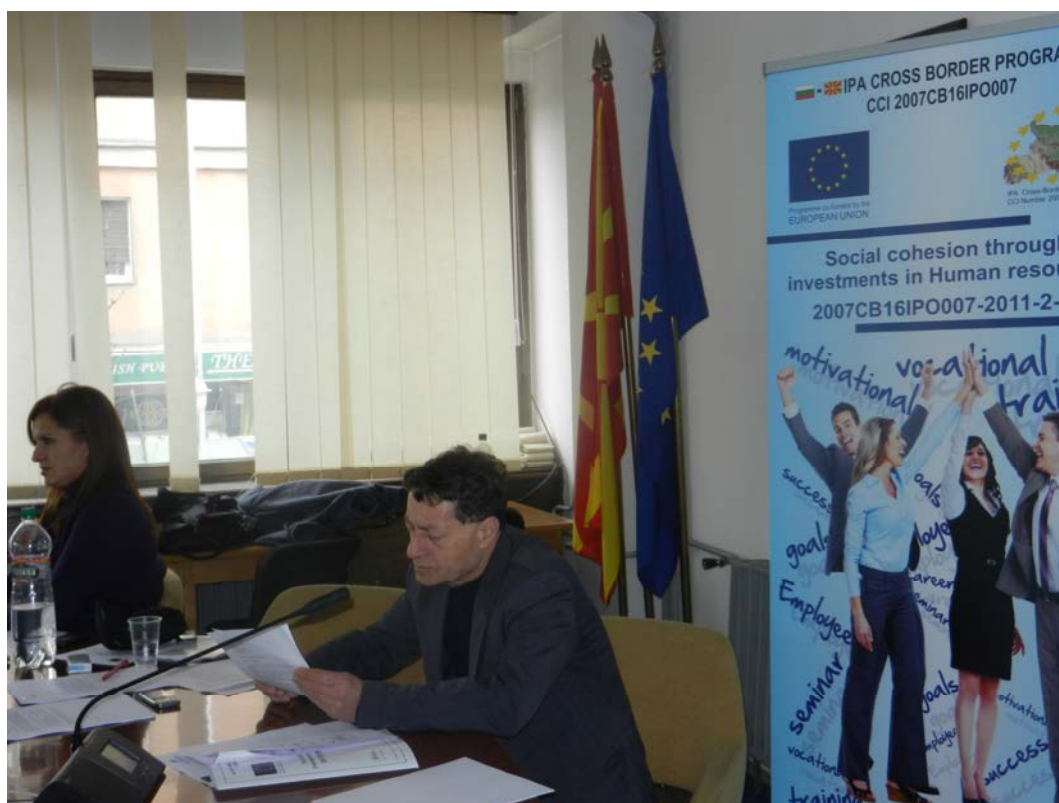
Motivation training Kumanovo